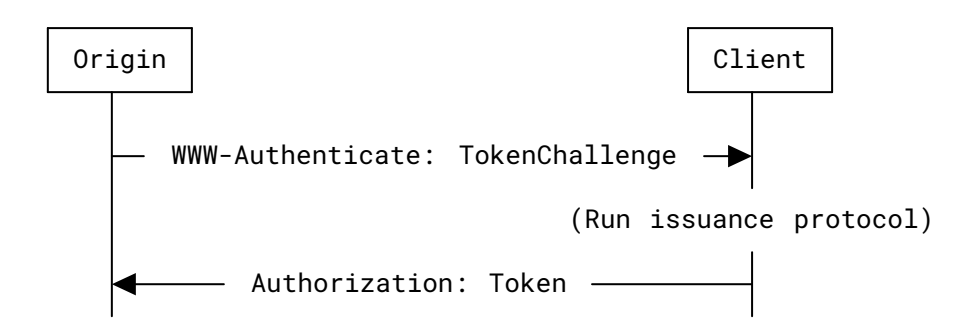
Figure 1: Challenge and Redemption Protocol Flow

In addition to working with different token issuance protocols, this scheme optionally supports the use of tokens that are associated with Origin-chosen contexts and specific Origin names. Relying parties that request and redeem tokens can choose a specific kind of token, as appropriate for its use case. These options (1) allow for different deployment models to prevent double-spending and (2) allow for both interactive (online challenges) and non-interactive (prefetched) tokens.